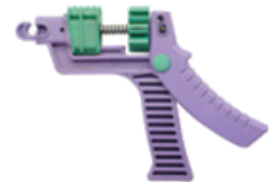
Hanging Sprinkler Assembly Tool