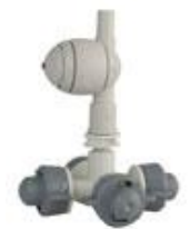
CoolNet Pro Fogger